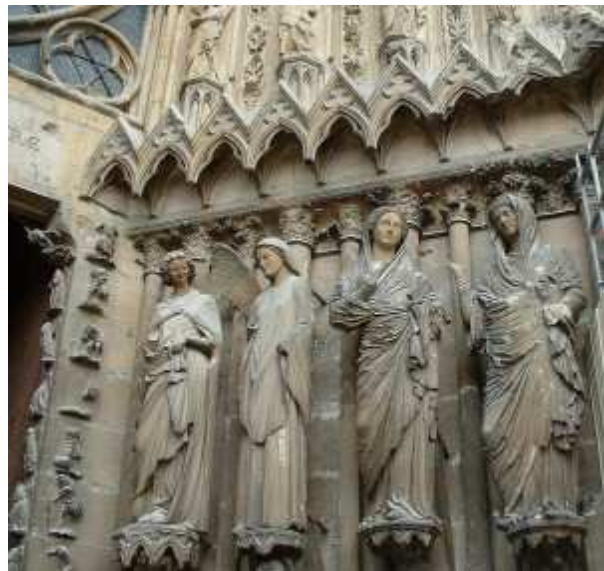
Reims Cathedral, Reims, France

Pieces from the 13th and 14th centuries will fill the cathedral's cavernous spaces. Azema said in choosing them she and the Boston Camerata musicians found inspiration in the building itself. The works make reference to Reims Cathedral's architecture as well as its past.